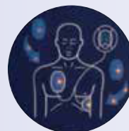
Visual cues prompt pad placement

Always ready. A System Status Ready Indicator flashes to show that the complete system is operational and ready for use. The device automatically runs a self-check each week.